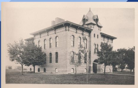
Lake Street School - Turn of the Century