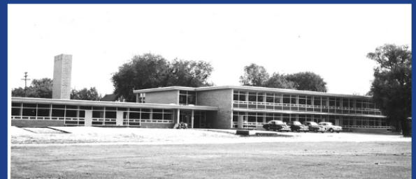
Edison - 1960